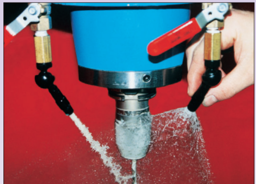
MillJets shown in use at various angles and spray widths.