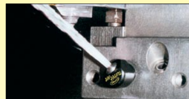
TurretJet shown installed in lathe turret.